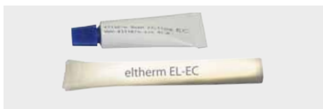
Beispiel / Sample